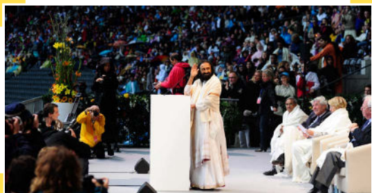
Gurudev addresses the gathering at Olympic stadium in Berlin during the 30 years celebration in July 2011.

Gurudev was central to the opening ceremony for the largest and most diverse multi-faith gathering of religious and spiritual communities in the world, The Parliament of the World's Religions in Melbourne in December 2009. He urged people and communities of faith, spirit and goodwill to "Make a World of Difference" in the midst of the challenges facing the global community.