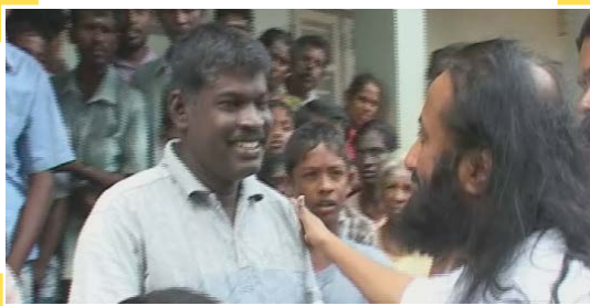
Gurudev offers solace and comfort to the people in the Manik camp for Internally Displaced People (IDP) Sri Lanka.