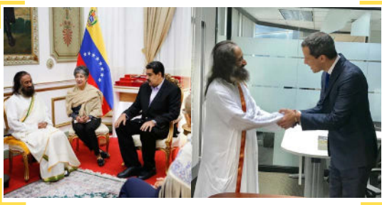
Gurudev met with several leaders of the Venezuelan government and the opposition to seek a peaceful path ahead for the country.