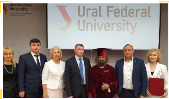
Honorary Doctorate by Ural Federal University, Russia, June 2019.