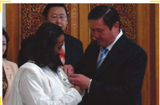
"Order of the Pole Star", top civilian honour of Mongolia, awarded by the President of Mongolia, Mr. Nambaryn Enkhbayar in 2006