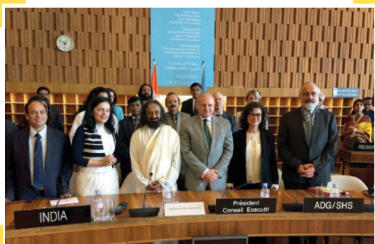
Gurudev addresses the gathering at UNESCO in France on the solutions for current global challenges, April 24, 2015.