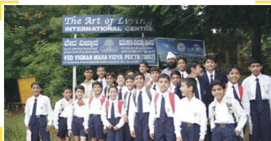
Kashmiri children at The Art of Living International Centre in Bengaluru, India. The children were previously staying in refugee camps. They have now found a safe haven at the centre.