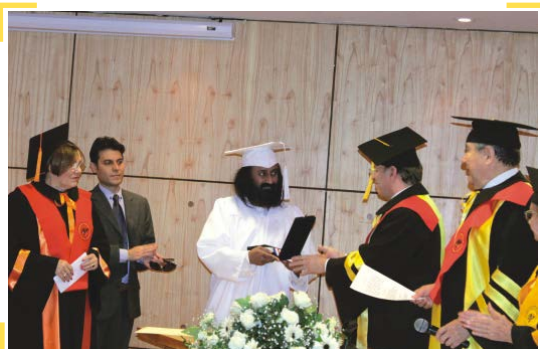
Gurudev receiving the highest civilian award of Paraguay, September 13, 2012