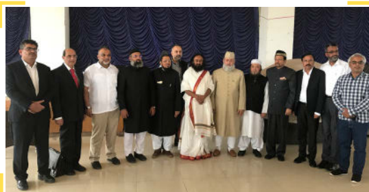
Eminent members of Sunni Waqf Board, AIMPLB and others met Gurudev Sri Sri Ravi Shankar in Bengaluru, India to express support for out of court settlement in the Ayodhya dispute.