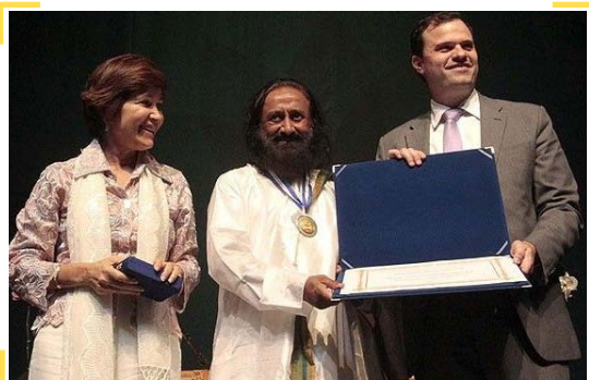
Tiradentes Medal in Rio, the highest honor from Rio de Janeiro State, September 3, 2012