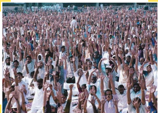
Over 30 million people from all walks of life have benefited from Art of Living workshops world-wide.