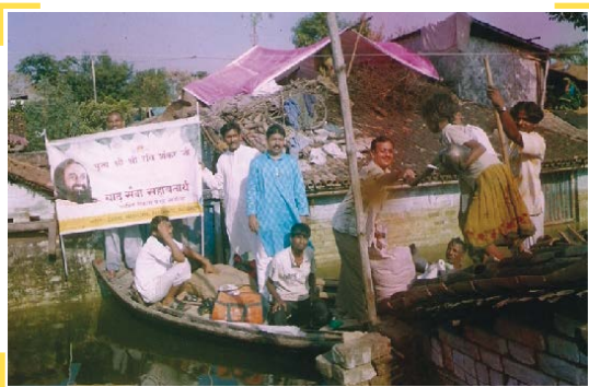
Art of Living volunteers provide emergency relief in remote areas of Assam and Bihar in the September 2007 floods.

Gurudev leads a worldwide network of volunteers to bring immediate relief and long term rehabilitation to people affected by disasters. The Art of Living has implemented disaster management and trauma relief initiatives for affected people in the aftermath of almost every major disaster in the world, including most recently: