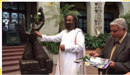
Gurudev was invited to 'Change the Rose of Peace' event in Guatemala City by the Ministry of Culture - an honor accorded previously only to peacemakers like the Pope and Mother Teresa, Guatemala, December 2016.