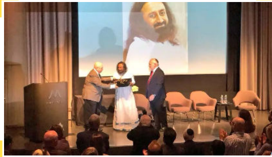
Simon Wiesenthal Center's International Leadership Award was conferred on Gurudev, Los Angeles, USA, April 2018.