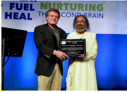
Global Humanitarian Award from the American Academy of Anti-Aging Medicine in Miami, Florida, May 1, 2022