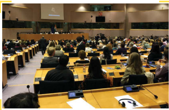
At 'The Yoga Way', an event jointly organised by Indian Embassy in Brussels, Gurudev addresses the European Parliament on relevance of Yoga for decision makers, April 21, 2015.