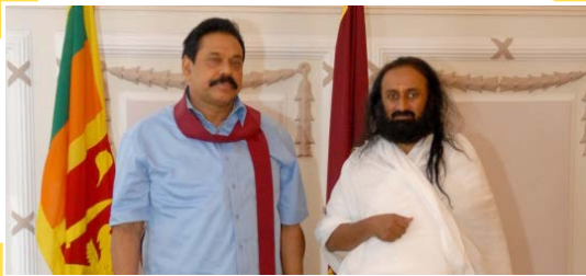
Mahinda Rajapakse, President of Sri Lanka, with Gurudev in April 2009, after an in-depth discussion of the Tamil refugees in the IDP camps.