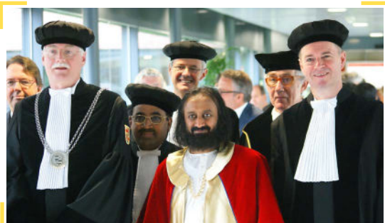
Honorary Doctorate conferred upon Gurudev by Nyenrode University, Netherlands, June 2012.