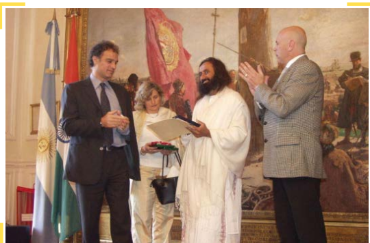
Gurudev is honoured with the Illustrious Visitor Award by government officials in Buenos Aires, Argentina in 2004