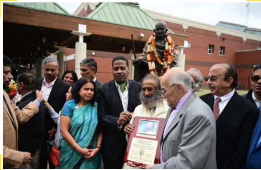
Gandhi Peace Pilgrim Award, Dr. Martin Luther King Jr. National Historical Center, USA, November 9, 2022