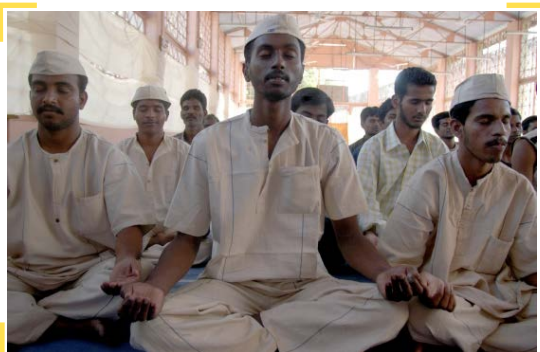
More than 350,000 inmates in jails around the world have been provided an opportunity for serious rehabilitation through The Art of Living programme.

“A disease-free body, a stress-free mind and a violence-free society are the birth right of every individual,” says Gurudev. He has designed a myriad of self-development programmes to release stress, create a sense of well-being, restore human values and encourage people from all walks of life to come together in a spirit of service and celebration.