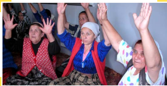
Women learn breathing techniques at an Art of Living trauma relief course in Plemetina Camp, Kosovo. The 105 participants, mostly Albanians, Serbs and Roma people, were all suffering from severe post-war trauma.