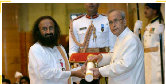
"Padma Vibhushan," India's top annual civilian honor, was bestowed upon Gurudev by the President in January 2016.