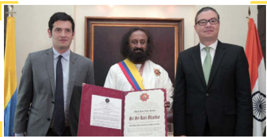
"Orden de la Democracia Simón Bolívar" Colombia's highest civilian award was conferred upon Gurudev by its Parliament in June 2015.