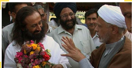
Gurudev with Kashmiri leaders during his visit to the state in 2006. The visit led to a rare dialogue between leaders of several Kashmiri separatist groups, including both factions of the All Party Hurriyat Conference and representatives of Kashmiri Pandits.