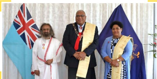
Gurudev was conferred with Fiji's highest civilian award by the President on October 26, 2024.