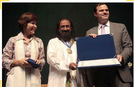
Tiradentes Medal in Rio, the highest honor from Rio de Janeiro State, September 3, 2012