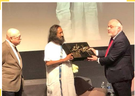
International Leadership Award by the Simon Wiesenthal Center at the Museum of Tolerance in Los Angeles on April 17, 2018