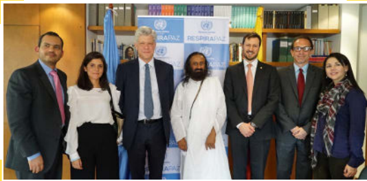
Gurudev meets UN director and victims of the conflict in Bogotá.