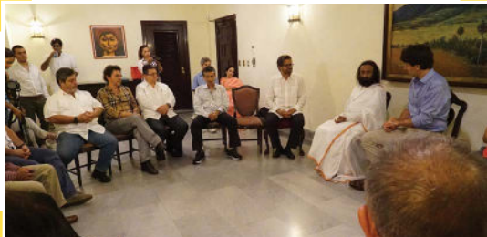
Gurudev travels to Havana where he maintains a dialogue with FARC Peace Delegation during three days. He invites them to embrace the Gandhian Non-Violence principle.