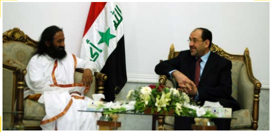
Gurudev in dialogue with Iraqi Prime Minister Nouri al-Maliki during his three-day peace mission to Iraq in May 2007.