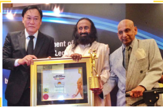
Gurudev was conferred the prestigious Asia Pacific Brand Laureate Award, Kuala Lumpur, March 2015.