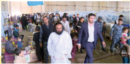
Gurudev visits refugees in different camps in Erbil, Iraq in November 2014.