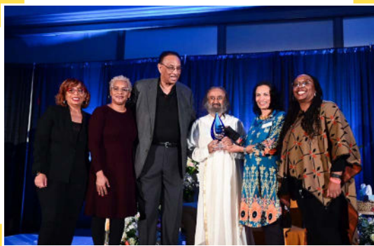
Emissary of Peace Award, National Civil Rights Museum, Memphis, USA, November 29, 2022