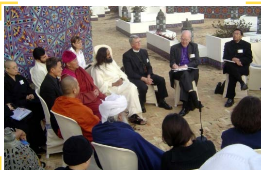
Gurudev at the Interfaith Conference for World Religious Leaders in Seville, Spain. He has played a vital role in promoting interfaith dialogue. He encourages individuals to follow their chosen spiritual path while honouring the path of others.

Gurudev is engaged in bridging religious, social, ideological and economic divides in society by enlivening the ancient Indian ideal of Vasudhaiva Kutumbakam (One World Family). He reminds us that diverse traditions and cultures have their roots in the same basic human values of peace, compassion, truth, belongingness and non-violence. The Art of Living serves society with a non-denominational, secular and holistic approach.