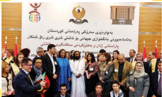
Gurudev addresses the peace conference and honours Kurdish Kobani woman fighters.