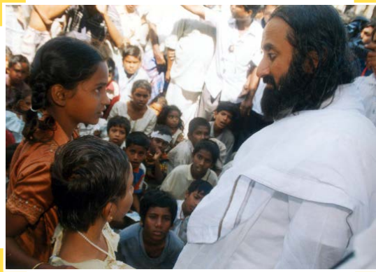
Gurudev consoles the victims of the December 2004 Indian Ocean Tsunami in Nagapattinam. This coastal town in Tamil Nadu, India was among the worst affected areas.