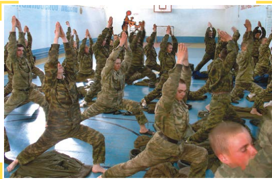
The Art of Living conducted trauma relief programmes for army personnel (involved in rescue operations), families, children and school teachers in the aftermath of the Beslan school hostage crisis.