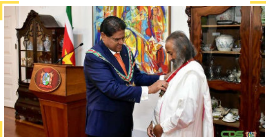
Gurudev was honored by the President of Suriname with their highest civilian award "The Honorary Order of the Yellow Star" in July 2022.