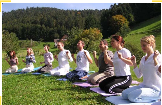
The Art of Living programmes eliminate stress, create a sense of well being, restore human values and encourage people to come together in service and celebration.