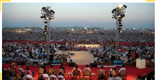
Gurudev leads a meditation for an estimated 2.5 million people at the 25th anniversary celebrations in Bengaluru, India in February 2006