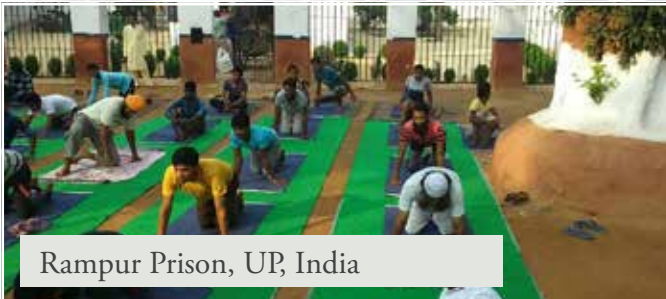
Rampur Prison, UP, India