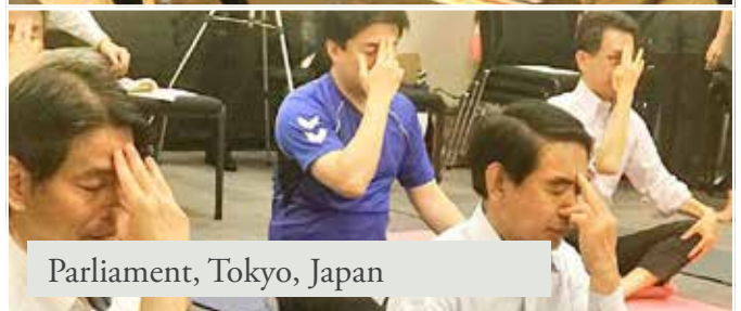
Parliament, Tokyo, Japan